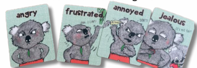
Coco Koala Emotions Cards include facial expression, body language, context (where needed), common verbalisations associated with the feeling, discussion on the back - plus downloadable teaching tips and activities for each emotion.